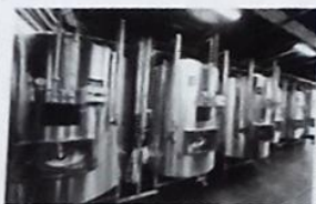
Pavel I. Photo and Video/Shutterstock.com